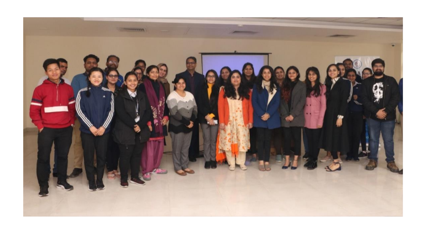
Group Picture of the participants and the expert for the workshop